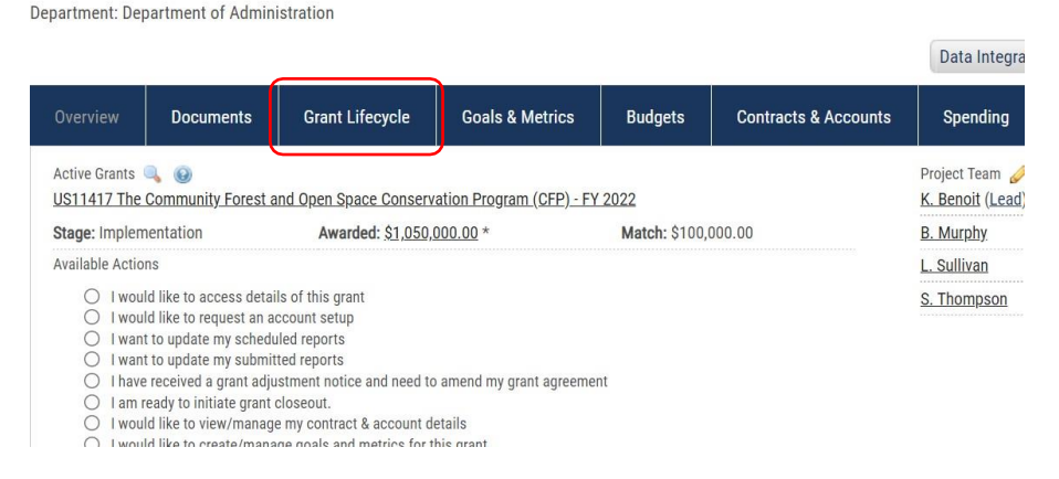
Project Dashboard: Conservation Programs

The "Grant Lifecycle Report" will show you all submitted changes that have been made, as well as who made the change, and any notes or files that were included with the change.